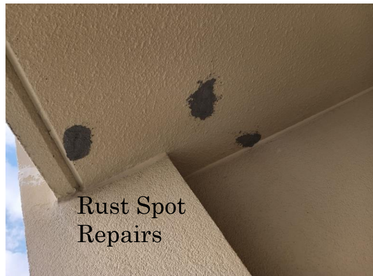
Rust Spot Repairs