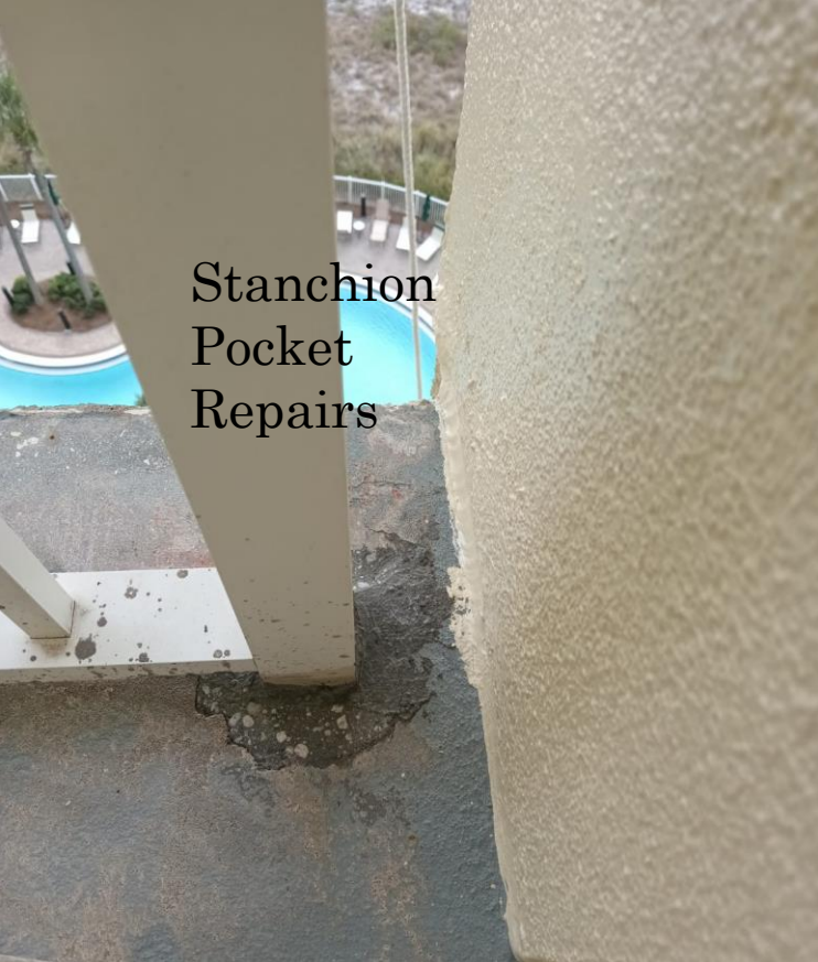
Stanchion Pocket Repairs